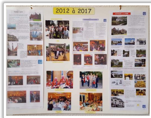
50 Years of Twinning !

The following Group Activities are planned:-